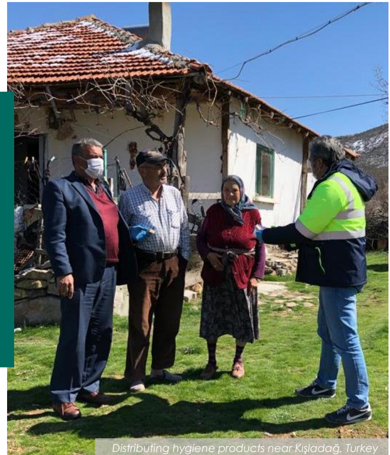
Distributing hygiene products near Kışladağ, Turkey