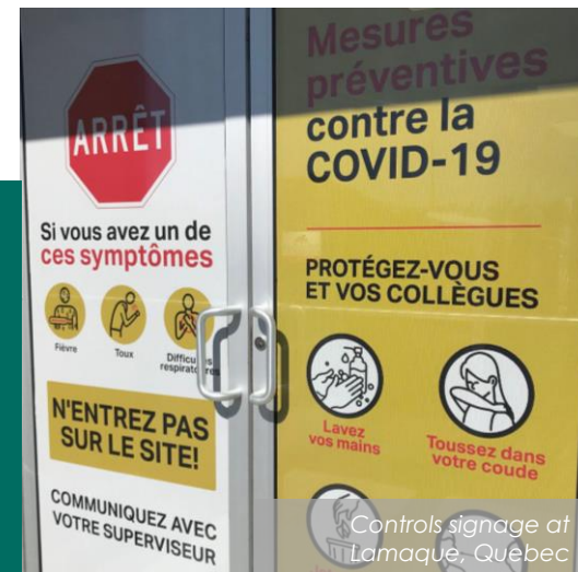
Controls signage at Lamaque, Québec