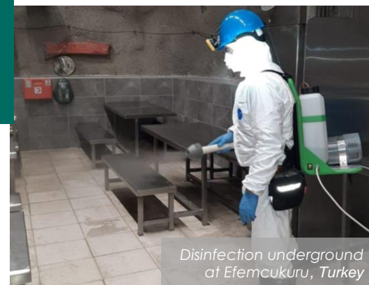
Disinfection underground at Efemcukuru, Turkey