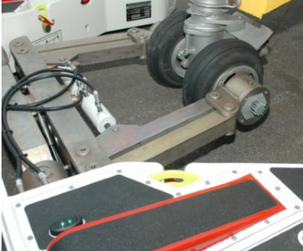
Typical Clamping of Undercarriage Wheel

The Handler is charged by local mains power supply, which can be between 96 to 264V AC.