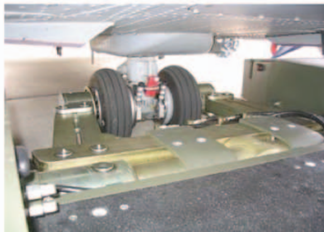
Typical Clamping of Undercarriage Wheel

The Handler is charged by local mains power supply, which can be between 96 to 260V AC.