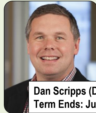
Dan Scripps (D) Term Ends: July 2, 2023