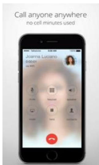
Talkatone App Calling