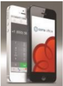
Ooma Office Mobile HD app