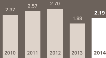
Basic Earnings Per Share (In Dollars)