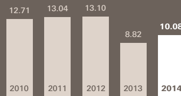
Return On Average Common Equity (Percent)