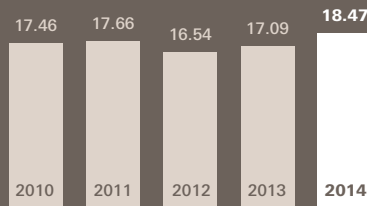
Operating Revenues (In Billions of Dollars)

* Not a financial measure under generally accepted accounting principles. See Glossary on page 36 for additional information and specific adjustments made to this measure by year.