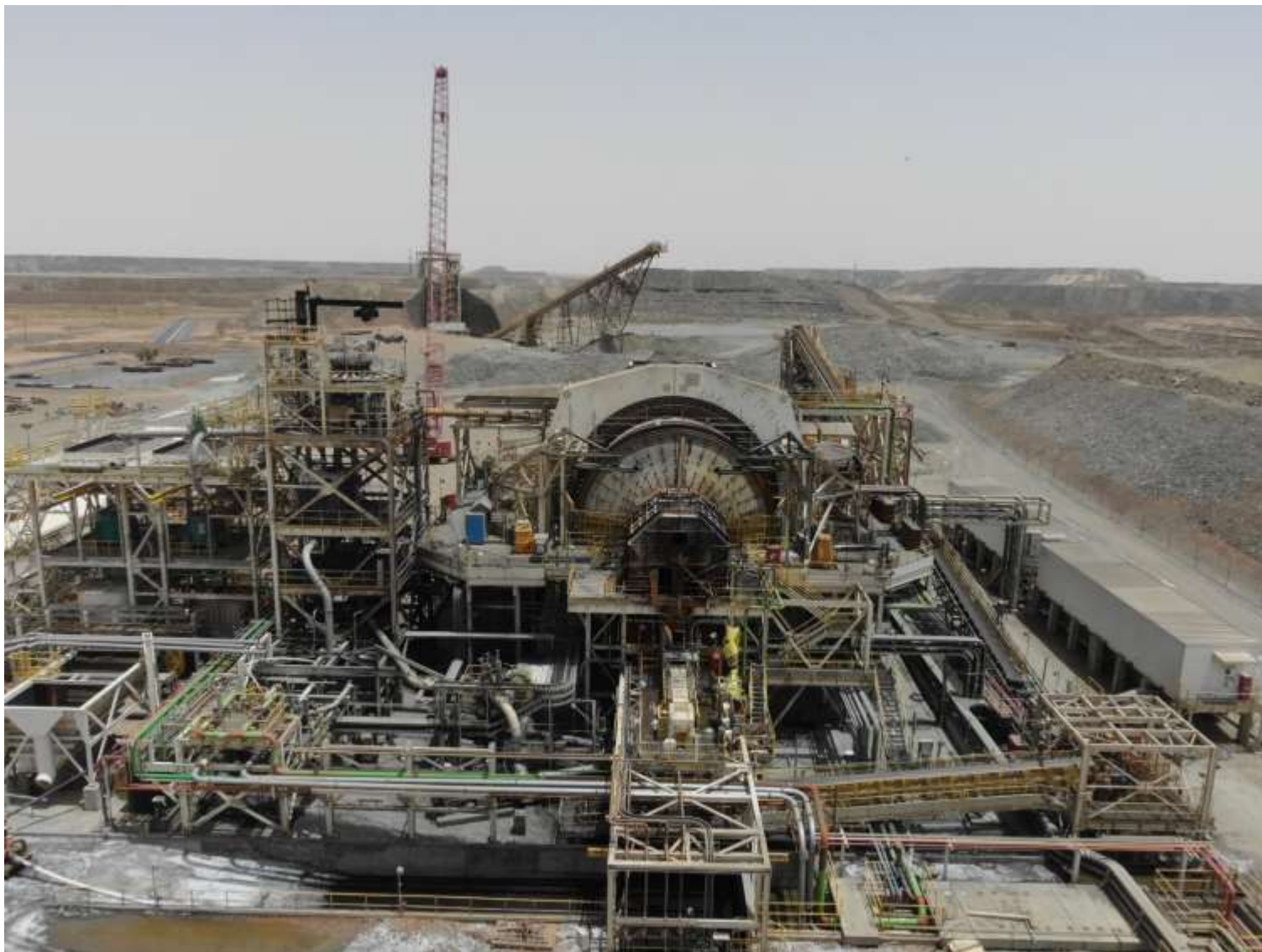
Figure 1: Discharge end of the SAG mill showing trommel screen (under its cover)